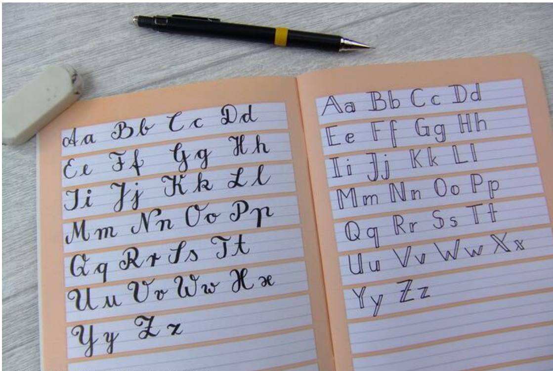
Hand Lettering - Schreibübungen Buchstaben

One method for collecting fonts and design ideas is jotting down various designs of a word in your notebook. Experiment with different pens. Bear in mind: practice makes perfect!