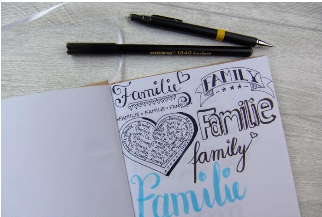
Hand Lettering - Schreibübungen Familie

One method for collecting fonts and design ideas is jotting down various designs of a word in your notebook. Experiment with different pens. Bear in mind: practice makes perfect!