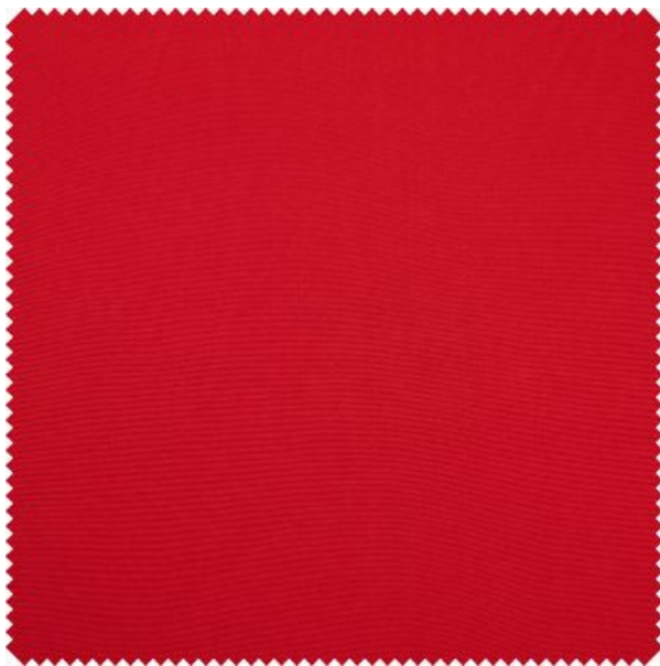
Cotton fabric "Uni", Flame Red