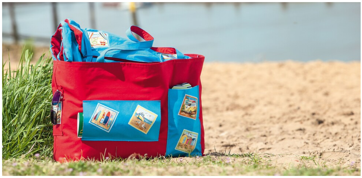
And this is how you do it

In this large bag there is room for everything you need for a trip to the bathing lake, even the large self sewn beach sheet. Especially practical are the small patch pockets that keep glasses, flip-flops, magazines and the like handy.