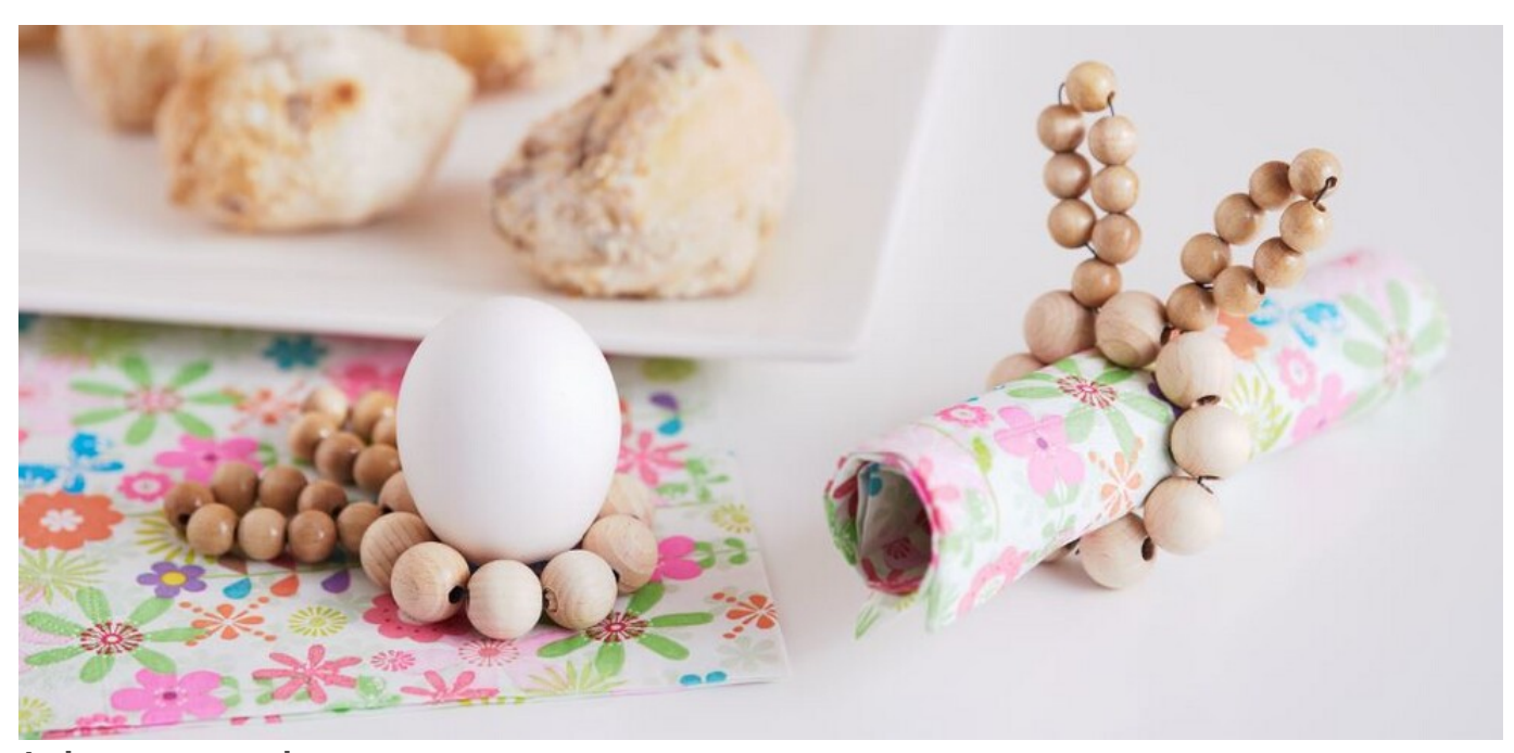
And so you proceed

Would you like to have an original table decoration for Easter? How about these cute bunnies from They Wooden balls. can be used as egg cups, or Napkin holder simply as a pendant in the Easter bush. The great thing about these bunnies: You need 2 only different things to make them.