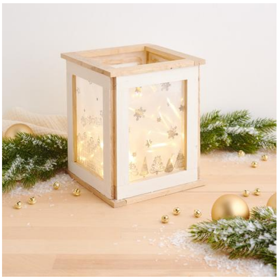
Beautiful DIY craft lantern: step-by-step instructions