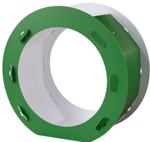
Lantern blank "Round", Green