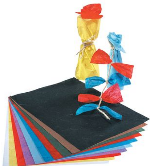
Fibre silk, 10 sheets