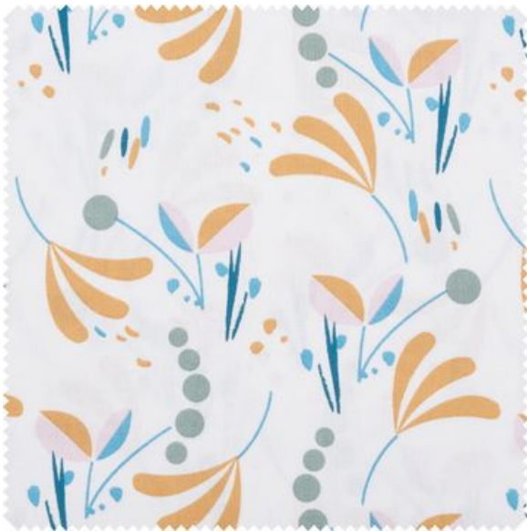
Cotton fabric "Lorena" Howel Amber