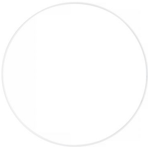
Metal ring "Circle", White, Ø 10 cm