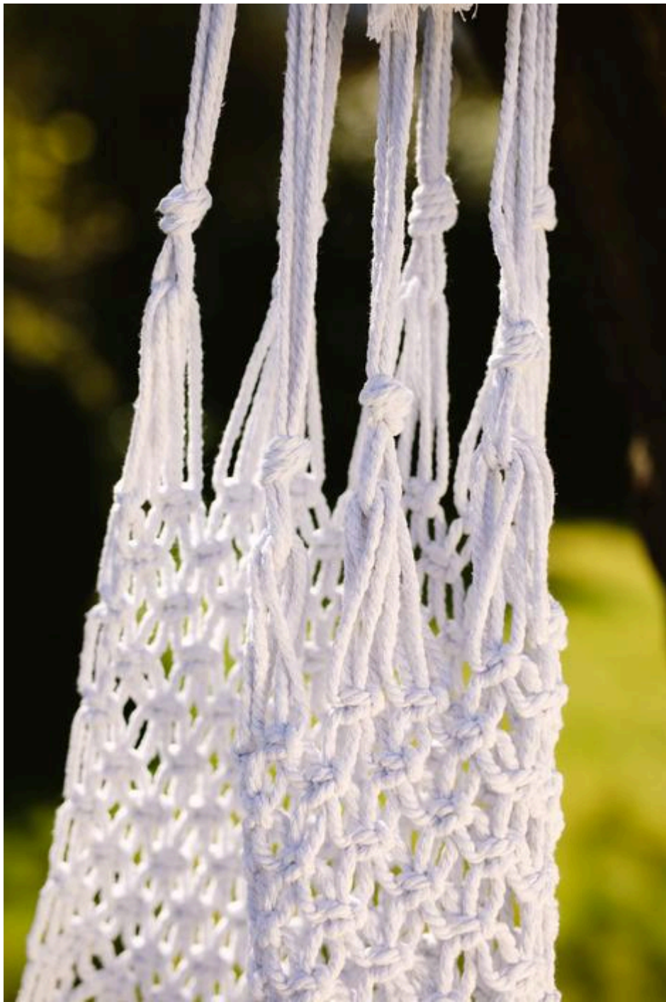
Knot suspension cords on macramé piece