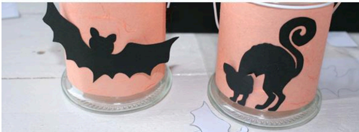
Step 3: Final lighting