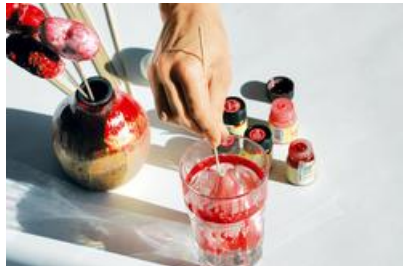
Step 4: Marble the Heart

Now, slowly dip the heart on the wooden skewer into the color dip. The film of paint wraps around the heart. Then, quickly pull it back out to avoid overlapping of the colors. You can lightly blow away the film of paint to preserve the colors.