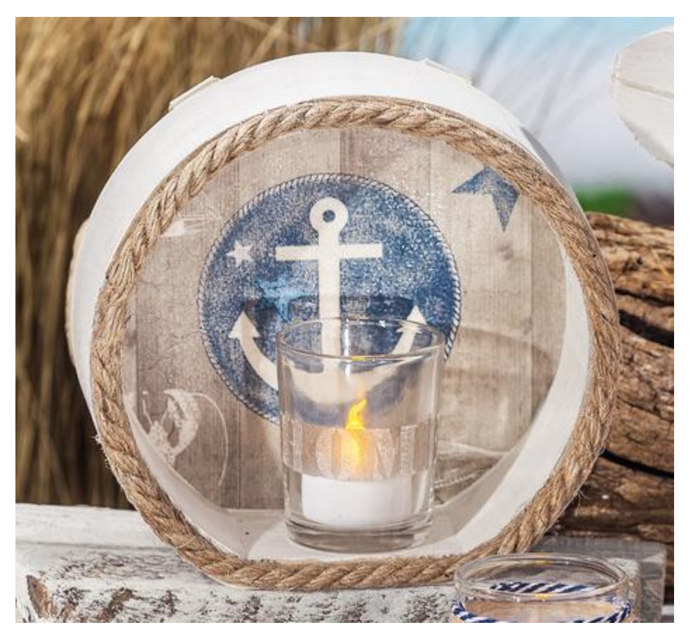
sur le même thème...