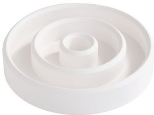
Silicone casting mould "Stick candle holder Chic"