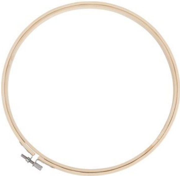
VBS Embroidery hoop, Ø 24 cm