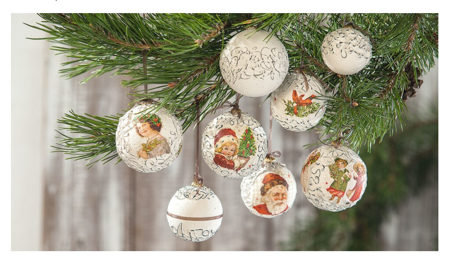
Here's how it works

The nostalgic napkin motifs are perfect for creating Christmas tree balls. The decorative snow liner provides a beautiful plastic structure on the Christmas Balls.