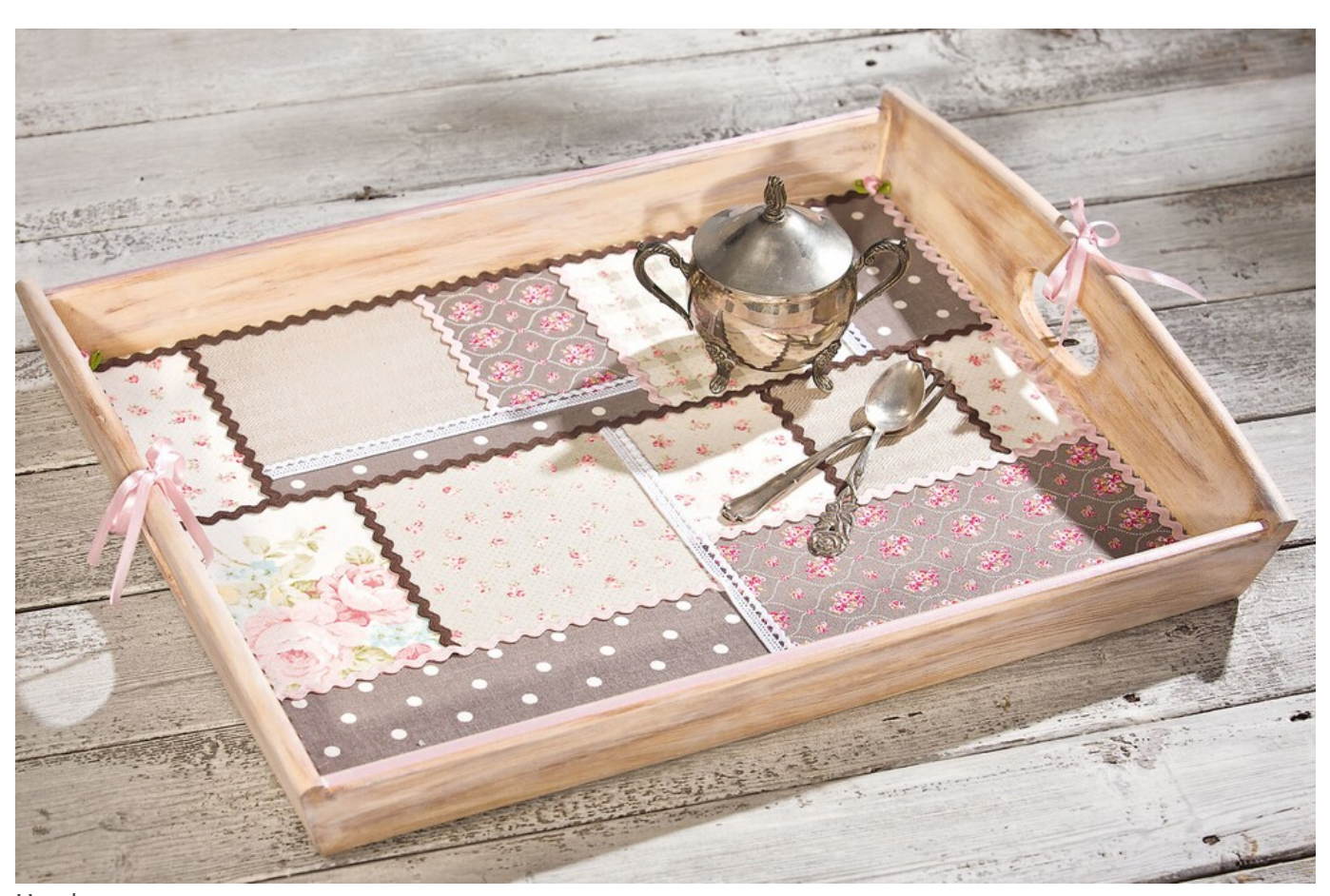
Here's how it works

Fabric is incredibly versatile. You can't only sew it, you can also glue it. Here, different cuts are joined together on a sturdy tray to form a patchwork pattern, the transitions are laminated with ribbons and lace. This gives the large tray an unusual country house look.