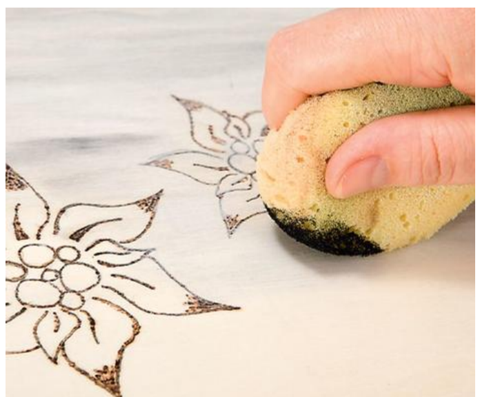
Step 2) Apply Handicraft paint with a fine sponge.

Step 1) Trace contours with the fine tip of the firing station. This idea is timelessly beautiful!