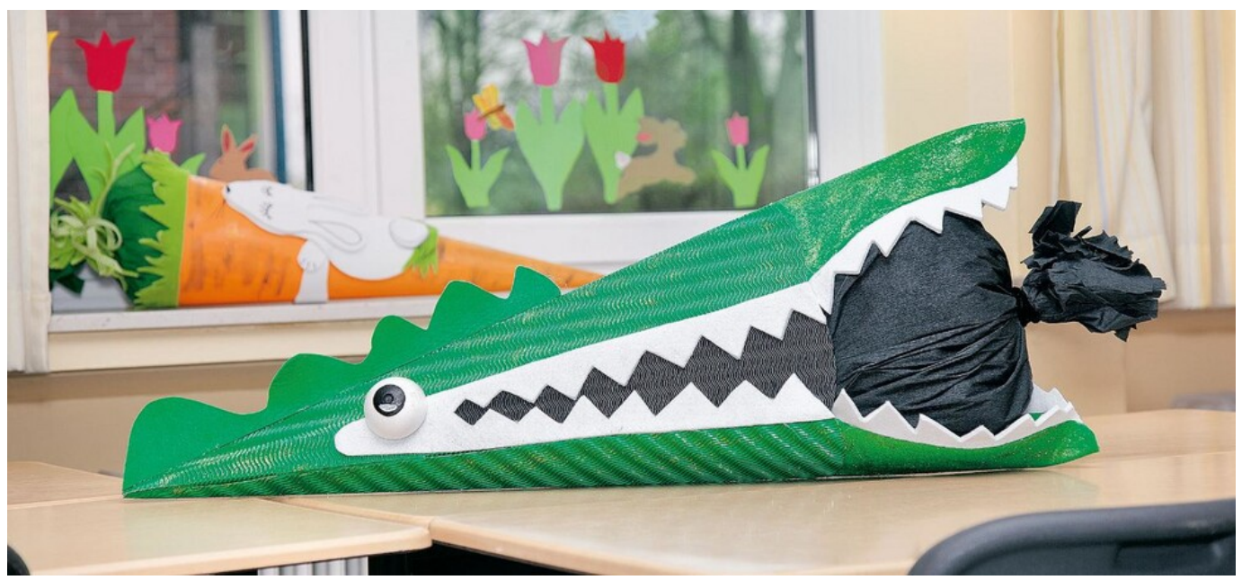
Handicrafts for school enrolment - School bag