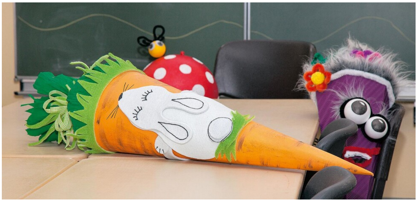
School bag for school enrolment "Rabbit & Carrot