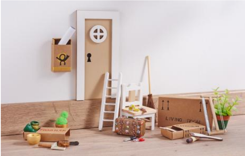
Tomte moves in