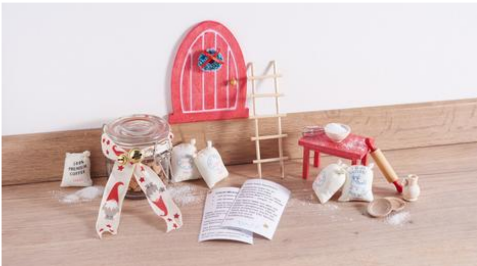
Tomte bakes biscuits