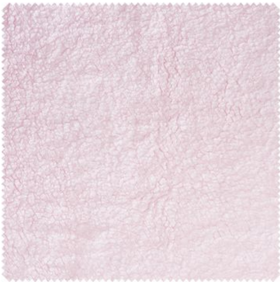
Fleece fabric "Lamb Rosé"