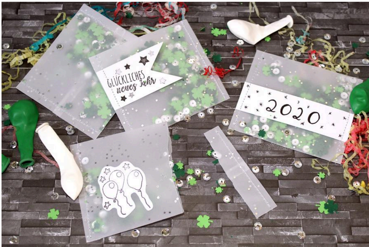
Step 1: Prepare the confetti bags

Look forward to making New Year's Eve or any other special event even more unforgettable with homemade confetti bags! In these instructions, you will learn how to make creative and individual confetti bags from simple materials. These original bags are not only suitable for the turn of the year, but also wonderful as gift idea or for birthdays and weddings. Let your creativity run wild and surprise your friends and family with something really special.