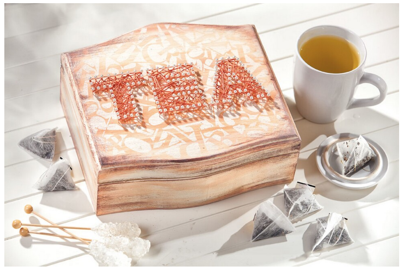
Here's how it works

With this beautiful tea box you can see immediately what is in it. The word "TEA" is placed over the stencilled motif with a large thread tension graphic - with simply Embroidery twist criss-crossing within the contours of the decorative-Needles.