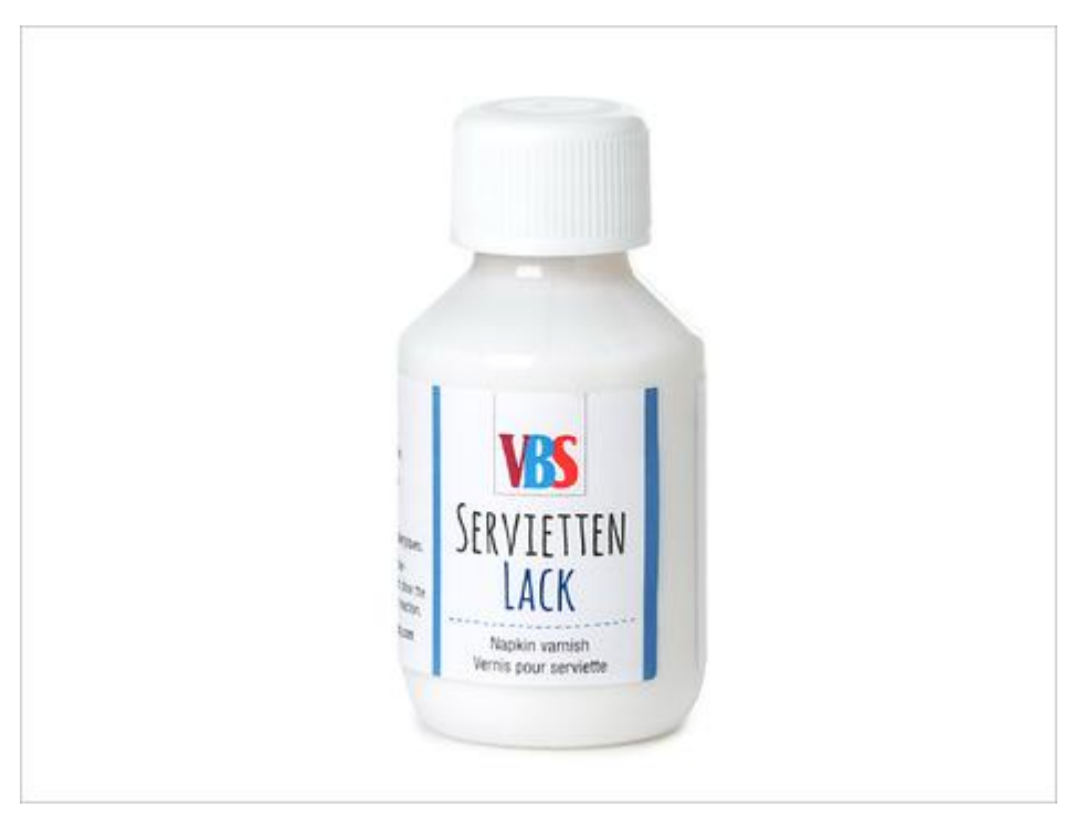
Napkin varnish Glossy