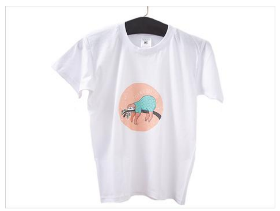
T-Shirt with Napkin