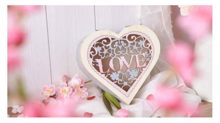
Idea 3 - Box with personal contents in the shape of a heart

can choose between funny sayings such as "Mr. Right" and "Mrs. Always Right" or cute figures that resemble you and your partner. With porcelain painting pens your desired motive can be transferred very easily.