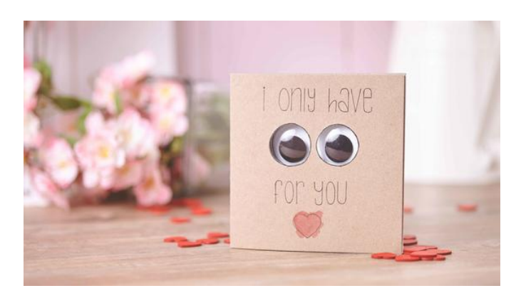
Idea 5 - Card with surprise effect

placeWobbly eyes on the cover of the card and draw two circles. Cut out the circles and write the text on them. Glue a piece of Paper in 12 x 12 cm into the card. Glue the Wobbly eyes correctly placed. Now draw a monster around the eyes with a pencil and shade it. Aqurelate the heart, which holds the monster.