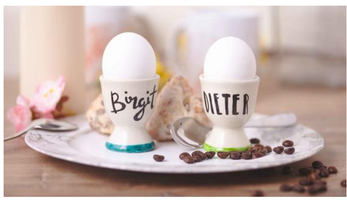
Idea 4 - Egg cup with name