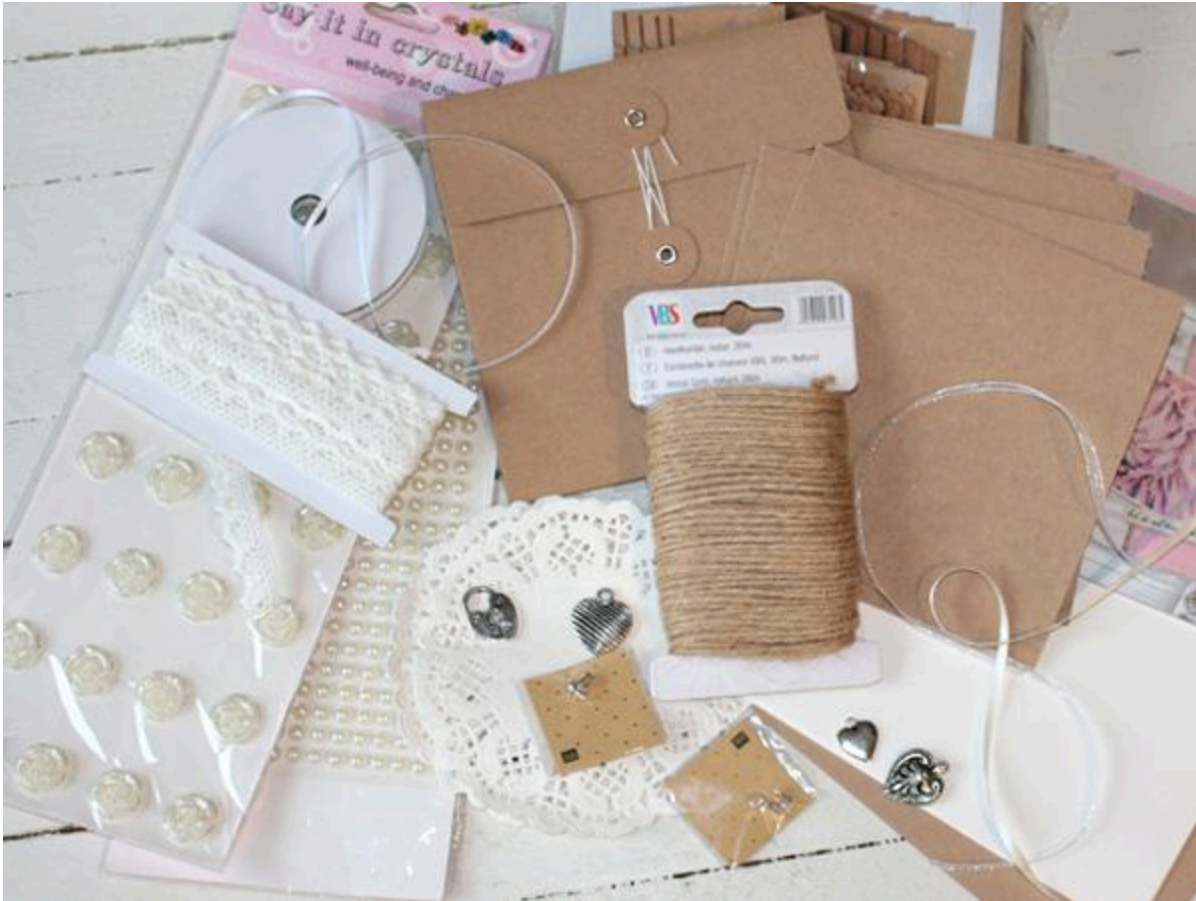
Step 1: Design