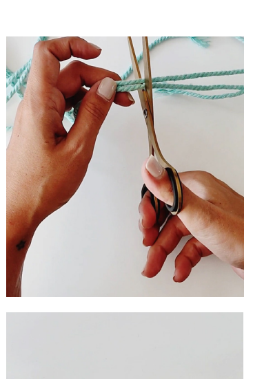
STEP 4 : Cut the long ropes and use the strings to make the next steps. Use one of it in the beginning of the leash, hold the work 20 cm and make a hangman's knot.