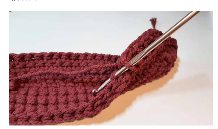
Rd 7 - 14: 1 ch (no stitch), 1 dc in every back loop, close rd.

Rd 6: 1 ch (no stitch), 1 dc into every horizontal loop behind the sl st (picture 1), close rd.